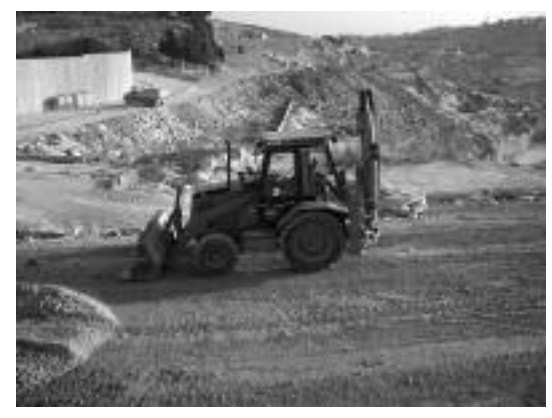
Caterpillar bulldozer working on Separation Wall

The Separation Wall has already caused immense hardship to the Palestinian people. The Wall has cut through Palestinian towns