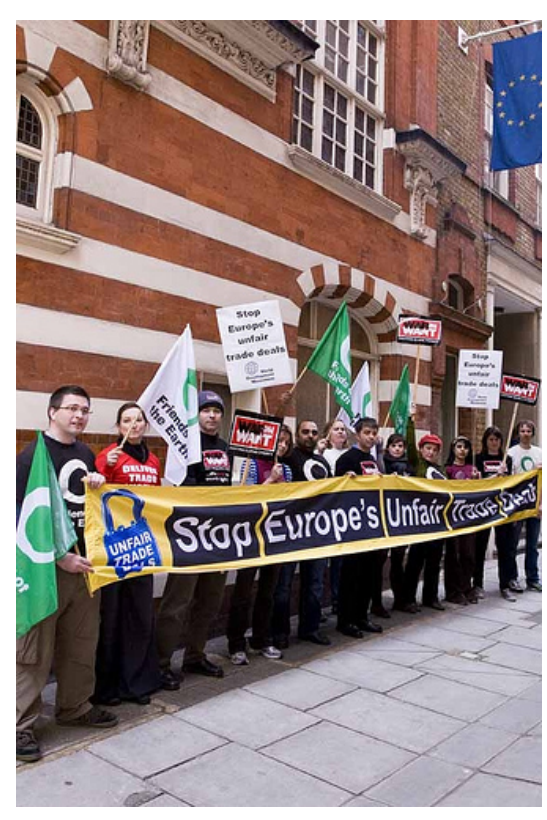
WSF Global Day of Action, London, January 2008

The EU's twin focus on FTAs and internal liberalisation stems from its failure to achieve its corporate agenda through multilateral channels. The EU's attempt to introduce a multilateral investment agreement failed first at the OECD and then at the WTO's Cancún Ministerial in 2003. The attempt to start WTO negotiations on public procurement and competition policy also failed at Cancún, while the European services lobby has repeatedly expressed frustration with the Commission's unsuccessful efforts to open up foreign services markets on its behalf. The