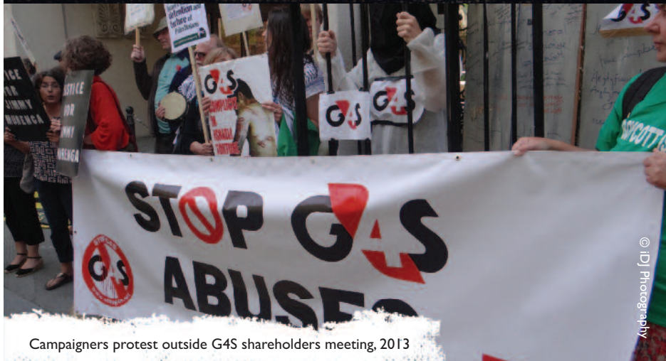
Campaigners protest outside G4S shareholders meeting, 2013