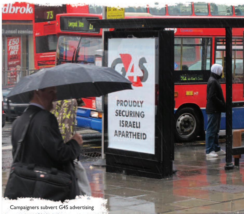
Campaigners subvert G4S advertising

In response to mounting international criticism of G4S for profiting from the occupation, G4S promised to exit a number of contracts in the West Bank. 17 Yet G4S has refused to withdraw from prisons in Israeli territory such as Meggido and Kishon. 18 Indeed, G4S has not indicated any intention to exit other controversial projects with the Israeli authorities, such as the £307 million contract for building and operating the Israeli police academy in Beit Shemesh.